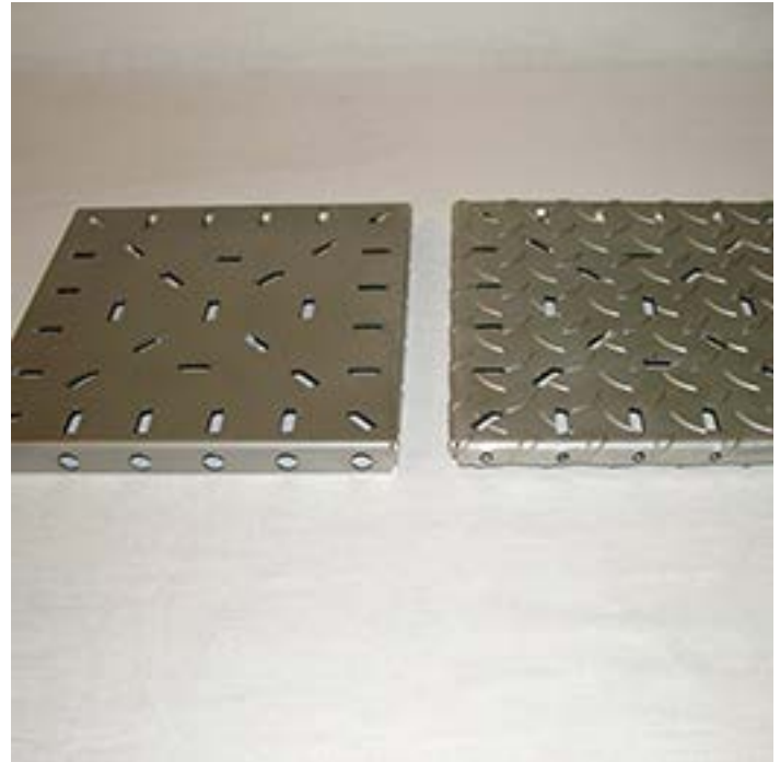
Folded Tiles Sample

Many factors affect the choice of cleaning method and frequency of its application. Suitable methods for stainless steel are: water and steam; mechanical non abrasive scrubbing; organic solvents and mild detergents.