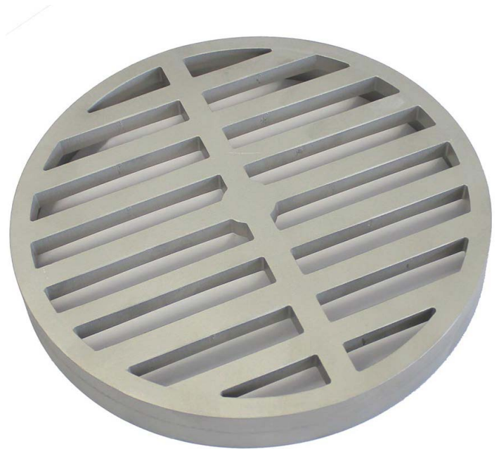
Laser Cut Ladder Gully Drain Cover

Classification of slip potential surfaces in wet and dry conditions are according to 'The Assessment of Floor Slip Resistance: The UK Slip Resistance Group (UKSRG) Guidelines issues 4 / 2011'. Results are obtained from tests carried out by our trained laboratory technicians in the internal laboraboraty. All figures are measured and expressed under laboratory conditions: Actual performance may vary from the above values depending upon site conditions. Contact the Technical Sales team for the actual slip resistant values or more information about the UKSRG.