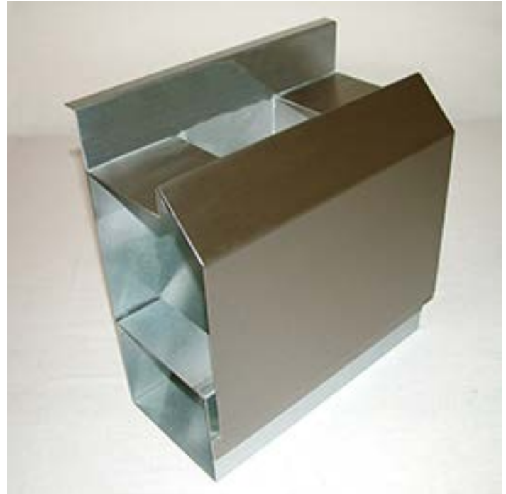
KA2 Kerb Sample

Many factors affect the choice of cleaning method and frequency of its application. Suitable methods for stainless steel are: water and steam; mechanical non abrasive scrubbing; organic solvents and mild detergents.