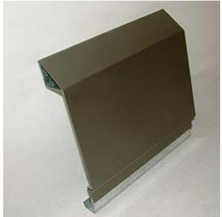
KA3 Kerb Sample

Many factors affect the choice of cleaning method and frequency of its application. Suitable methods for stainless steel are: water and steam; mechanical non abrasive scrubbing; organic solvents and mild detergents.