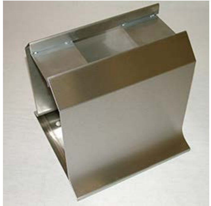
KC1 Kerb Sample

For advice regarding the most suitable ASPEN Stainless products for you, please contact our technical sales team today to discuss your requirements.