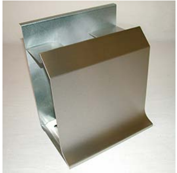
KC2 Kerb Sample

For advice regarding the most suitable ASPEN Stainless products for you, please contact our technical sales team today to discuss your requirements.