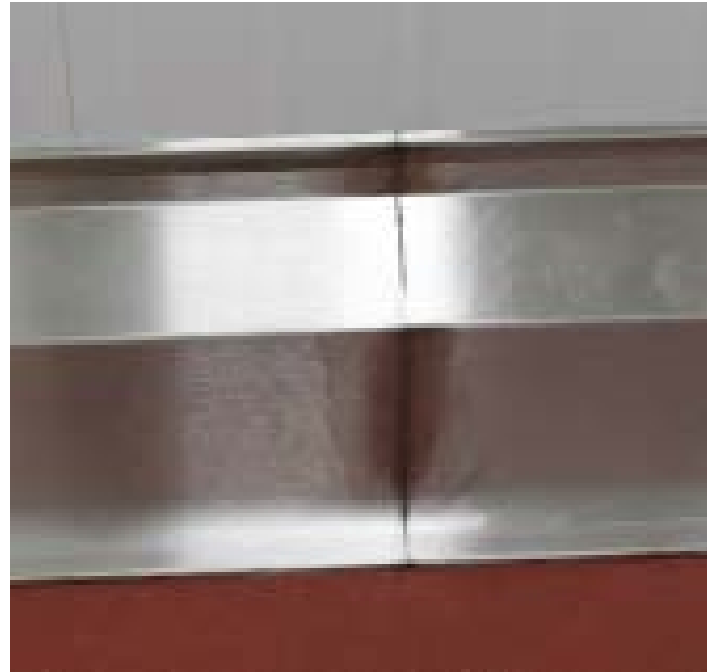
KE Wall Kerb Installation

For advice regarding the most suitable ASPEN Stainless products for you, please contact our technical sales team today to discuss your requirements.