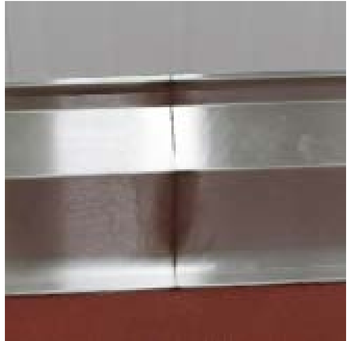
KE Wall Kerb Installation

For advice regarding the most suitable ASPEN Stainless products for you, please contact our technical sales team today to discuss your requirements.