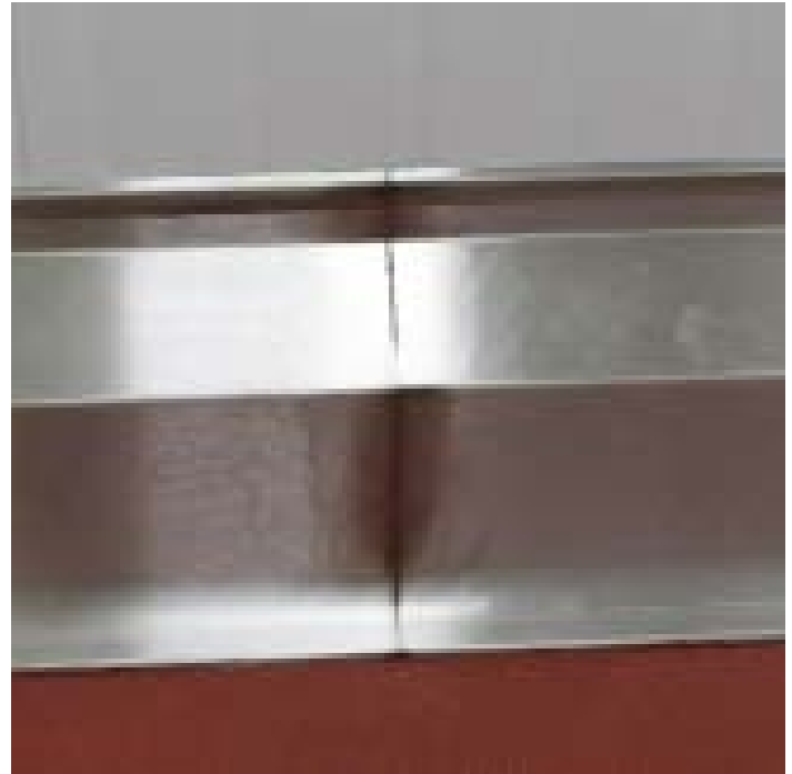
KE Wall Kerb Installation

Many factors affect the choice of cleaning method and frequency of its application. Suitable methods for stainless steel are: water and steam; mechanical non abrasive scrubbing; organic solvents and mild detergents.