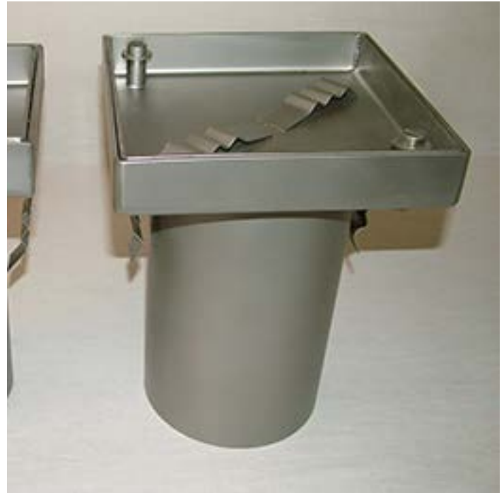
Straight Locking Rodding Eye Samples

For advice regarding the most suitable ASPEN Stainless products for you, please contact our technical sales team today to discuss your requirements.